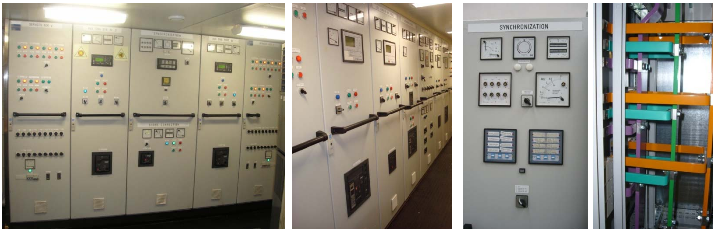
Main Switchboards 690V - 400V - 230V 50-60Hz - Emergency Switchboards 690V - 400V - 230V 50-60Hz DC Switchboards 24V-12V - Distribution Panels - Galley Switchboards

Existing documents and drawings will be updated As Built , ensuring your drawings and schemes are reliable.